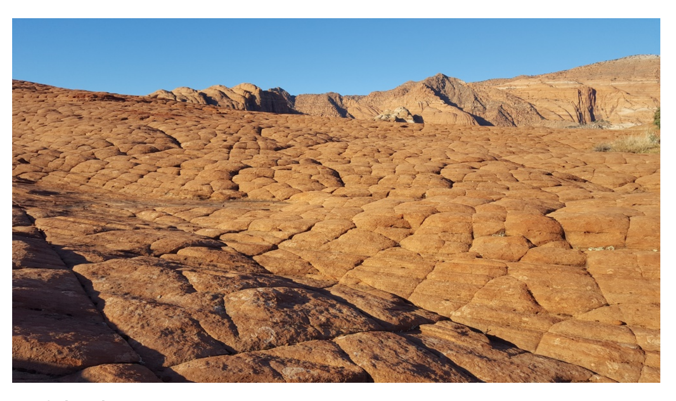
Petrified Sand Dunes in Snow Canyon

Thursday night I had some minor scooter maintenance to do so my exploration was limited to visiting a few sights near Hurricane. I had Friday off however, so I took the opportunity to explore the amazing Snow Canyon State Park.