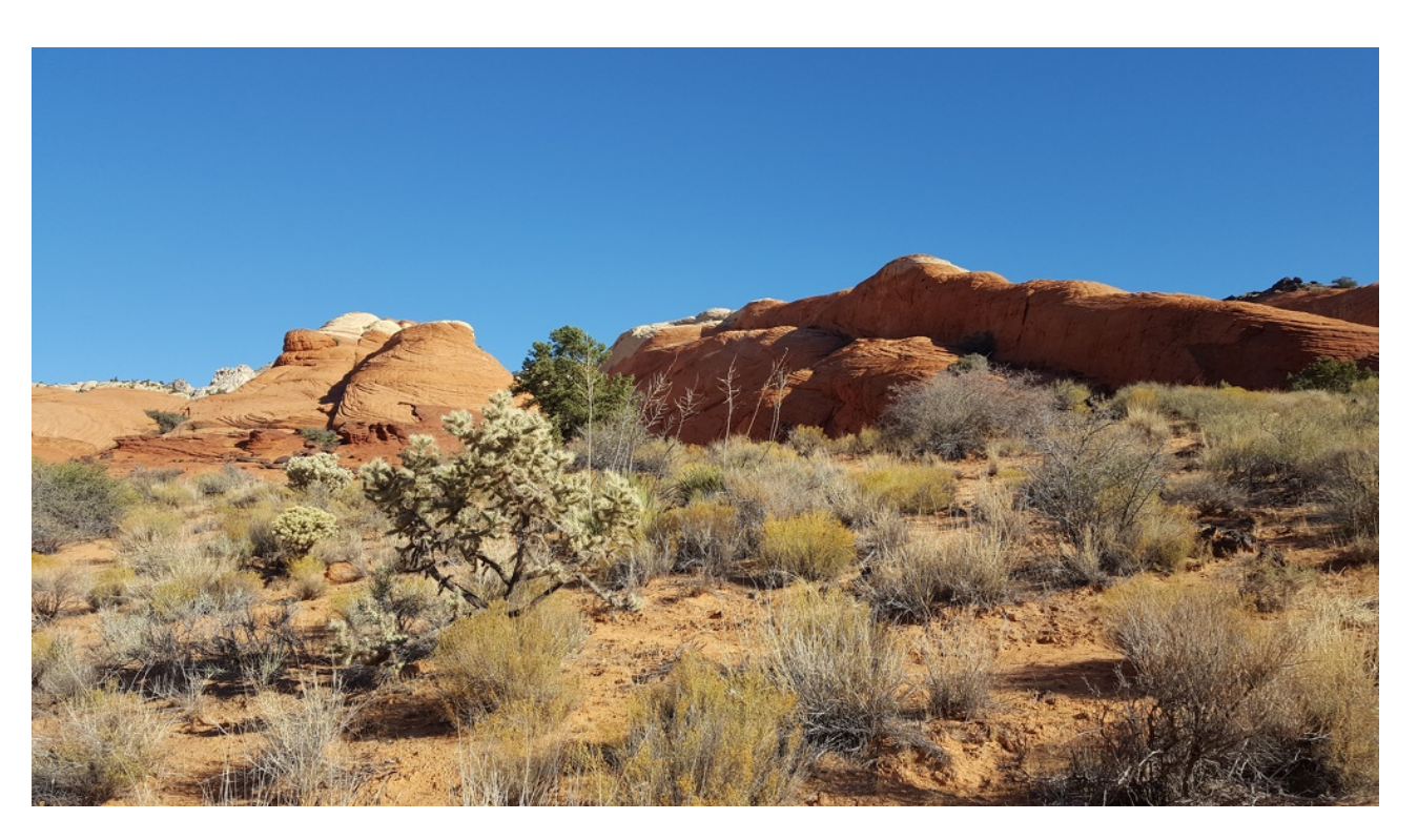
Obligatory cholla shot.

Burnt looking bits in above two photos are black lava rock, which also has a presence in the park.