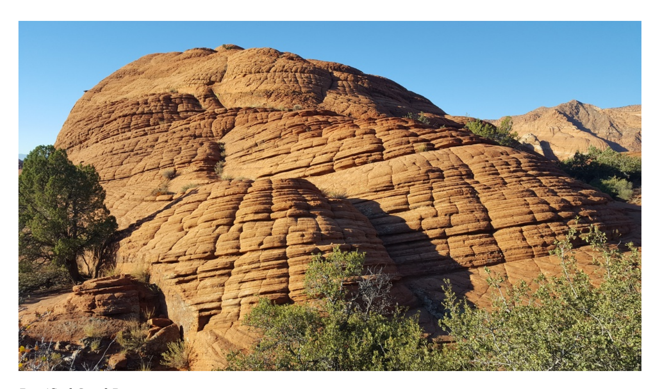
Petrified Sand Dunes.

Red Cliffs: pretty much exactly what the name says. Seemed like a fun park to explore but the sun was setting and the next day I had other plans: Snow Canyon State Park.