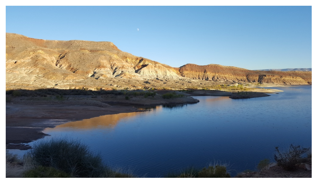
Moon over the reservoir.