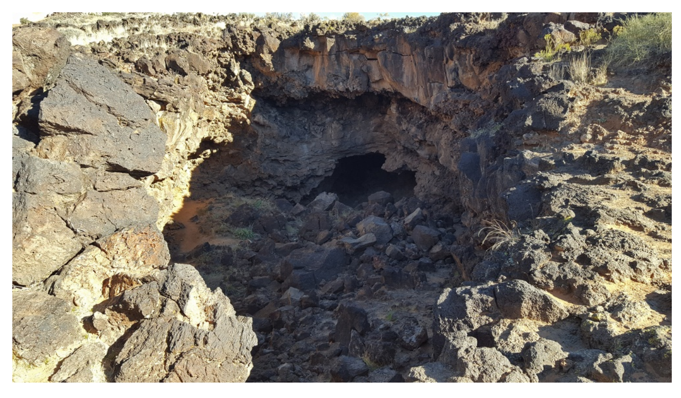
Lava Tube Entrance

One of my housemates had told me to bring along my flashlight in case I wanted to check out some of the caves. It turns out he meant the collapsed lava tube, which has multiple entrances. This is by far the easiest entrance, if you want to casually explore, the one near the observation point is the way to go.