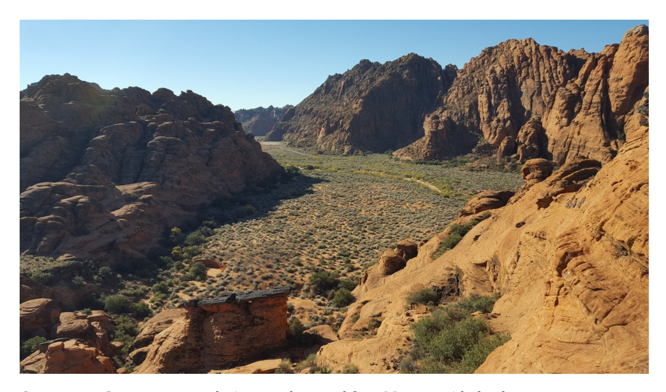
{\it Canyon: yes. Snow: not so much. Apparently named for a Mormon with that last name.}