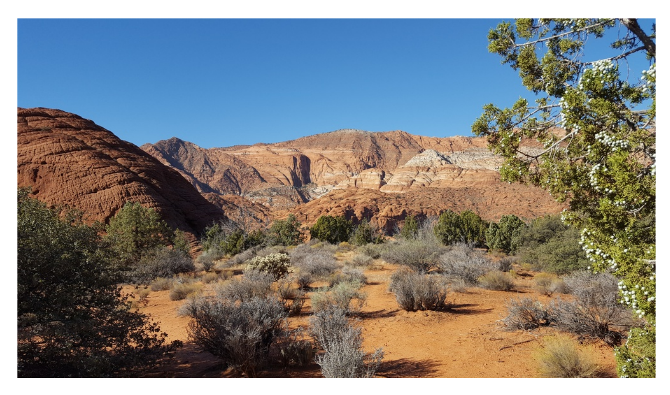
Snow Canyon State Park