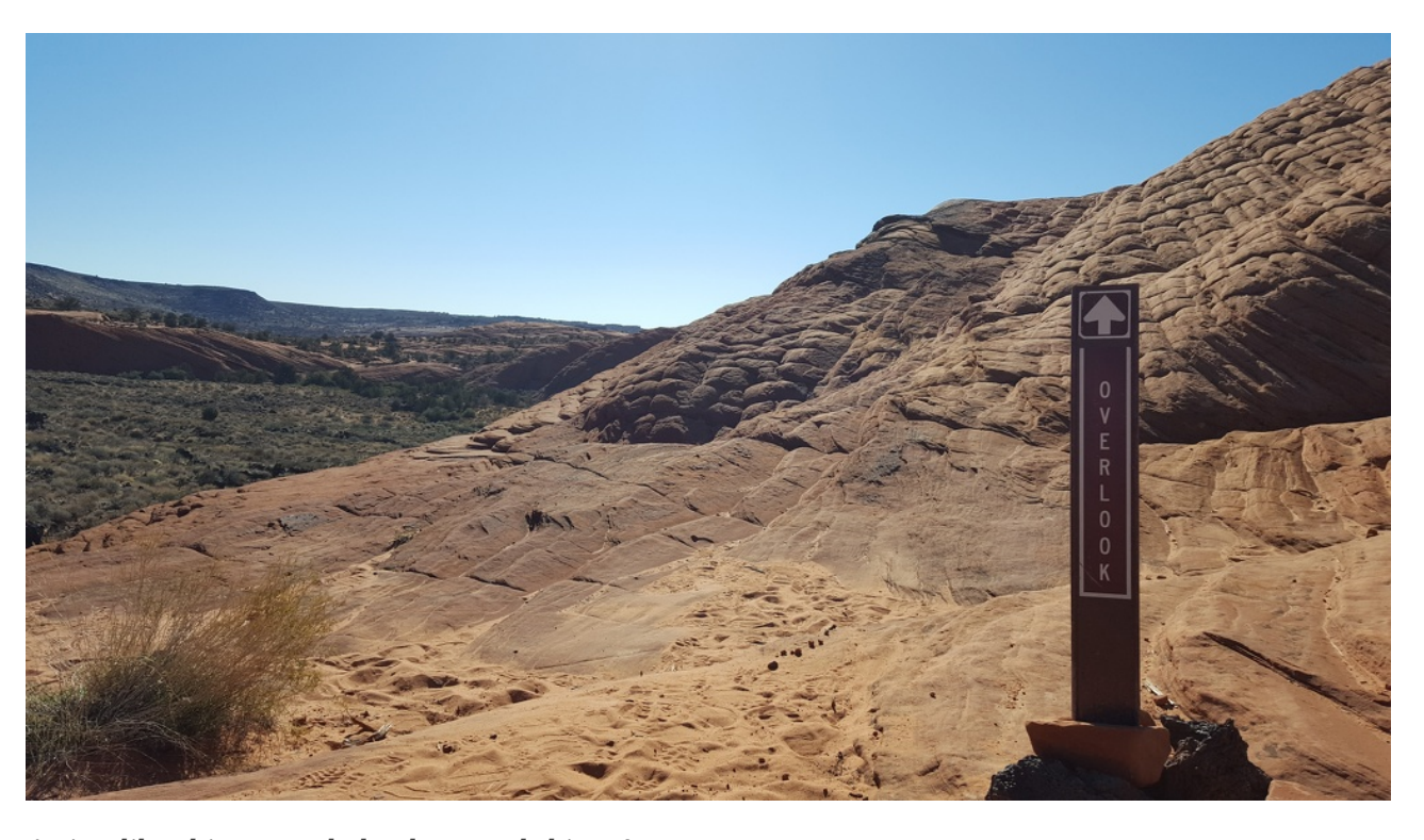
A \ sign \ like \ this \ can \ only \ lead \ to \ good \ things!