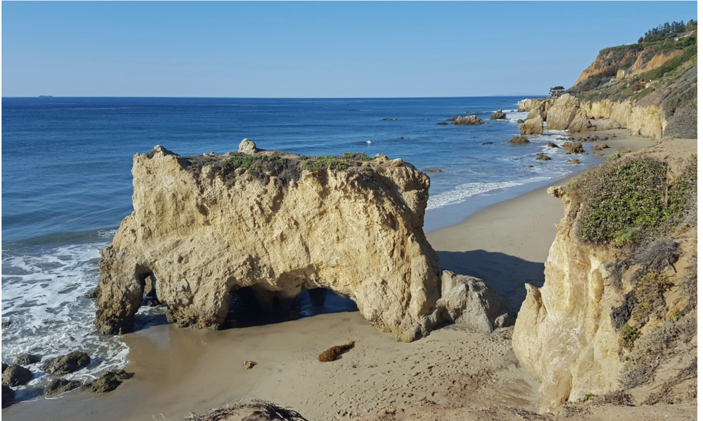
El Matador State Beach