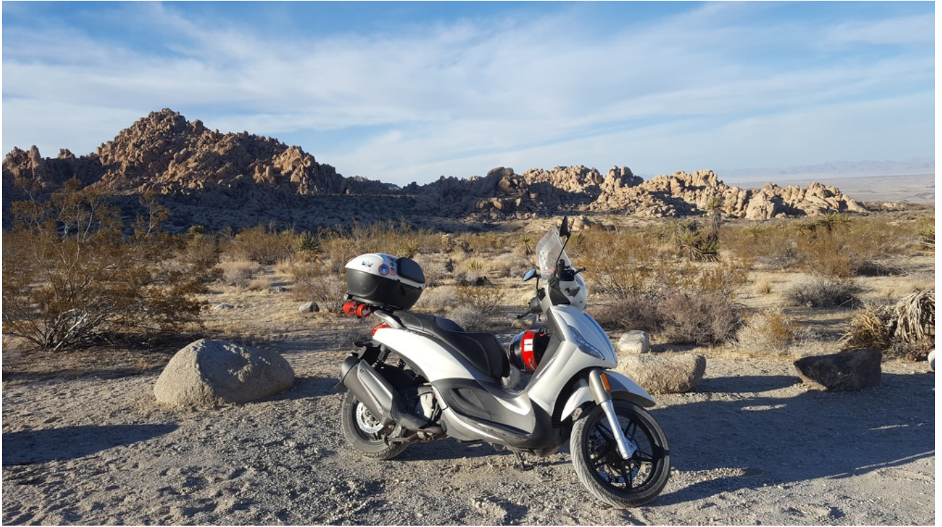
Scooter at the Indian Cove Nature Trail.

This short loop trail was a nice, quiet way to say goodbye to the park. I was planning on leaving the area after work on Friday and beginning my long scooter drive back to Ohio.