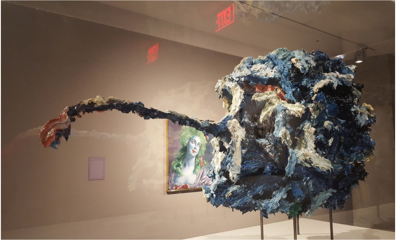
"Wooden Heart" by Glenn Brown, 2008

Some of Brown's work (like "Wooden Heart") is layers and layers and layers of paint which took years to create. Lots of referencing/recreating of other works of art, which is a fun treasure hunt.