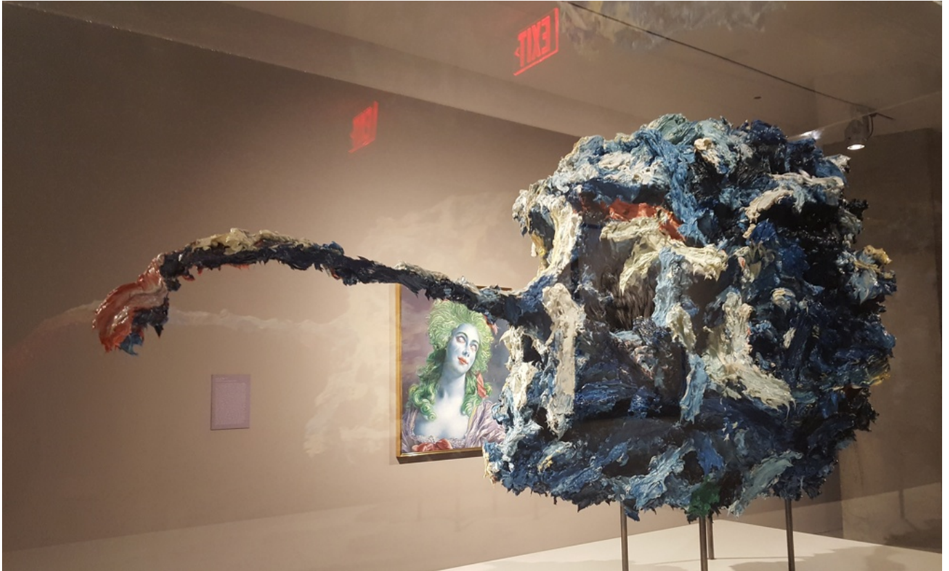
"Wooden Heart" by Glenn Brown, 2008

Some of Brown's work (like "Wooden Heart") is layers and layers and layers of paint which took years to create. Lots of referencing/recreating of other works of art, which is a fun treasure hunt.