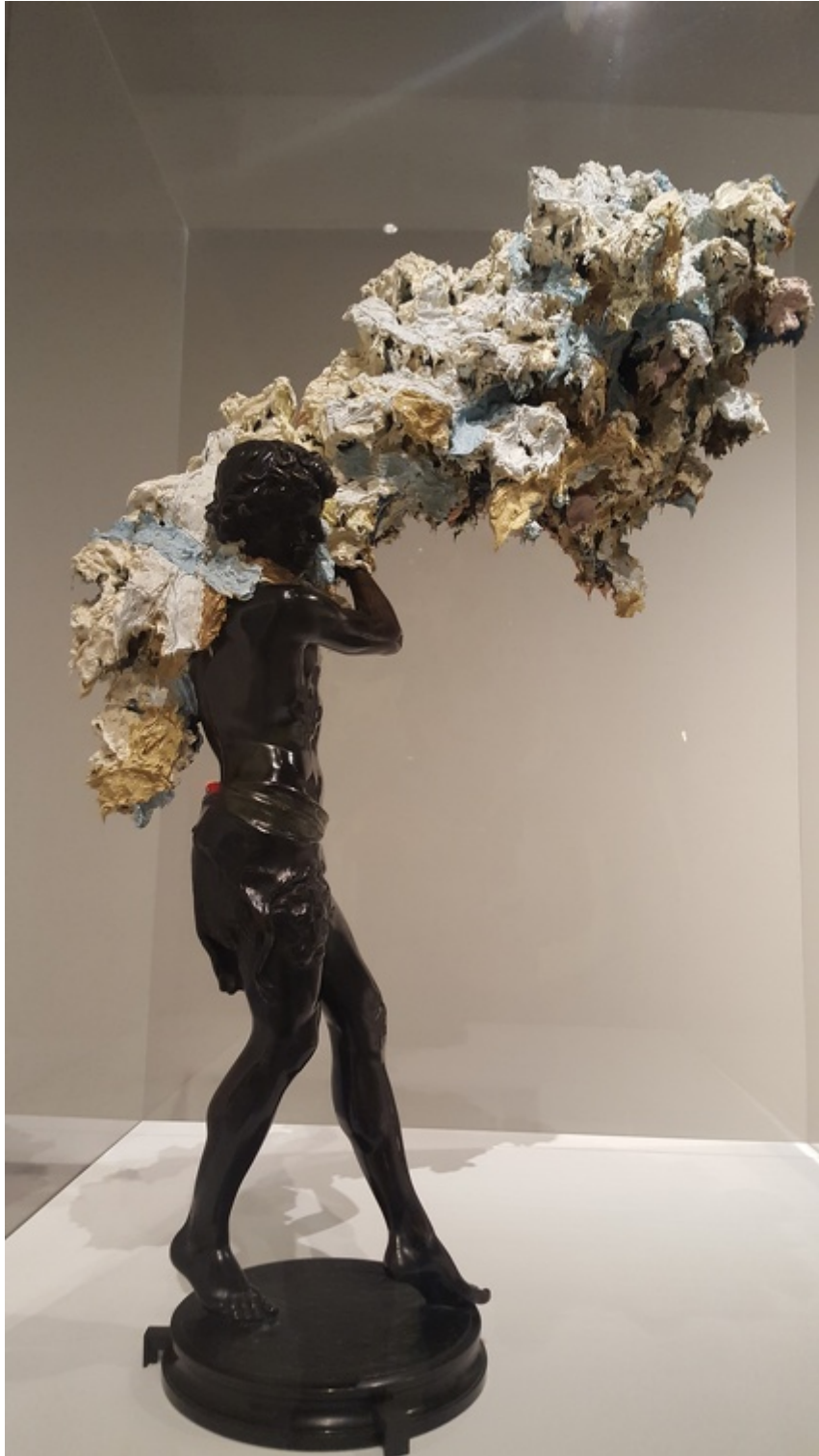
Work by Glenn Brown