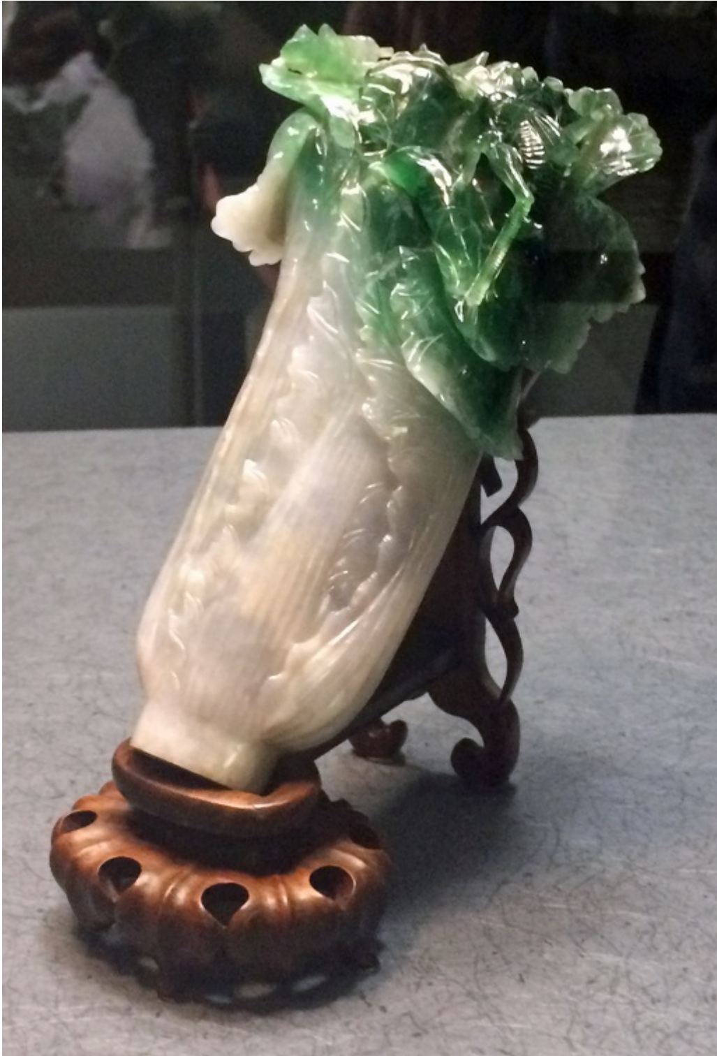
THE FAMOUS JADE CABBAGE! It's a big deal here.