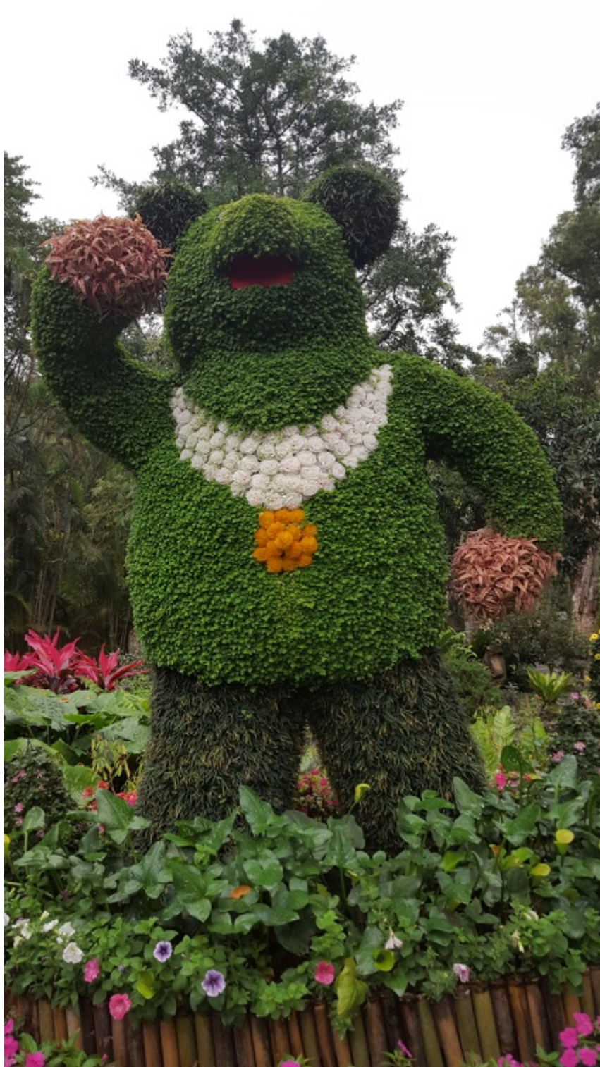
Topiary Outside Chiang Kai-Shek Shilin Residence