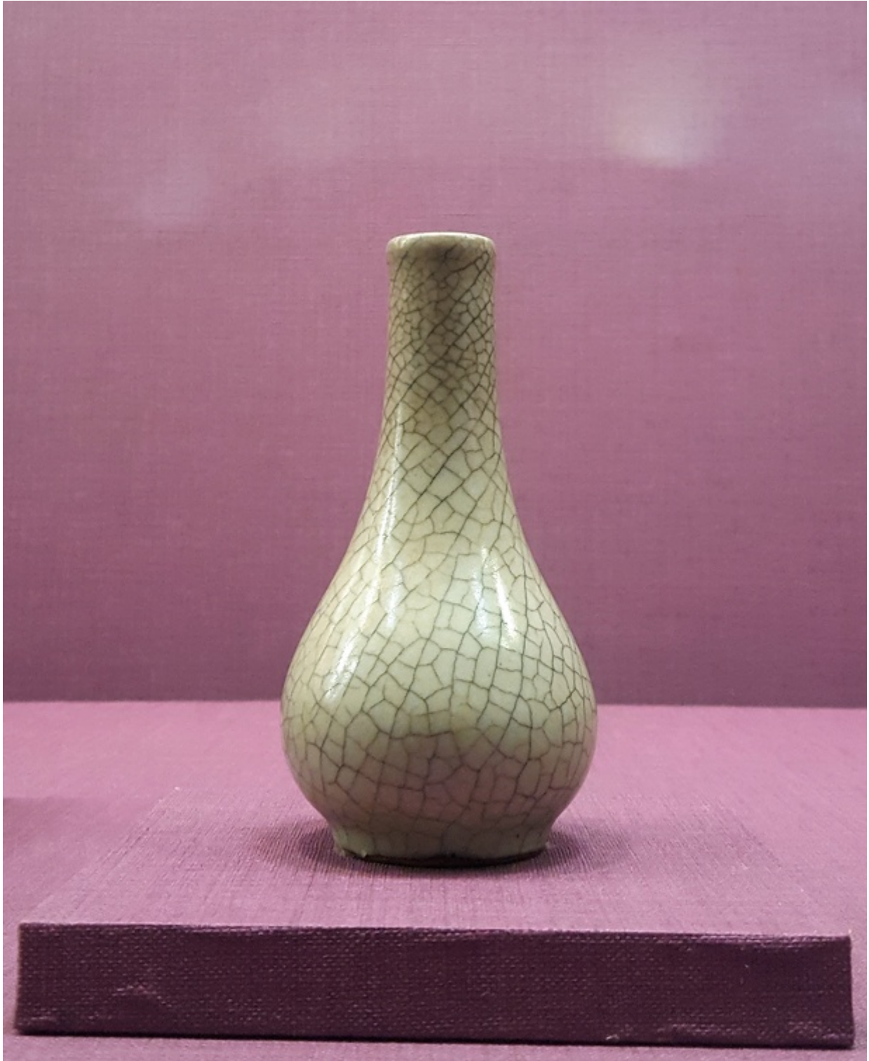
"Gall-bladder-shaped vase with celadon glaze", Yuan dynasty, 14th century. I refuse to comment on the suggestion that I took this photo entirely because it represents a set of objects