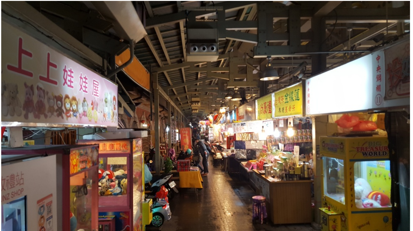
Shilin Night Market – this part was enclosed and featured various video and skill games.