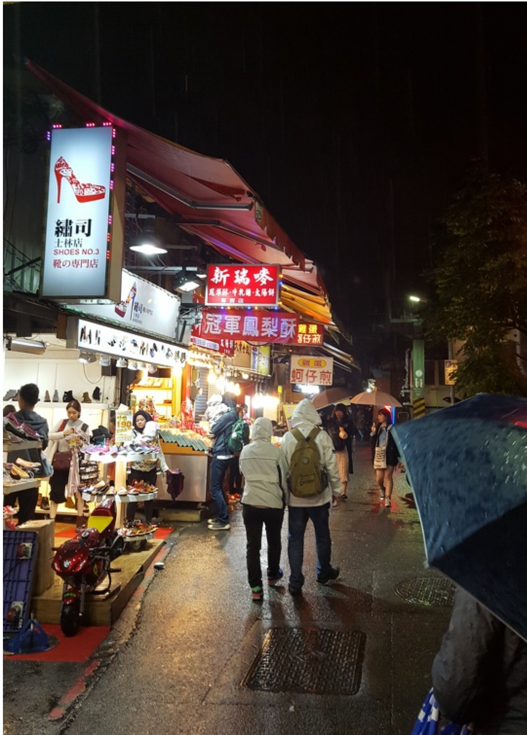
Outdoor area of the night market.