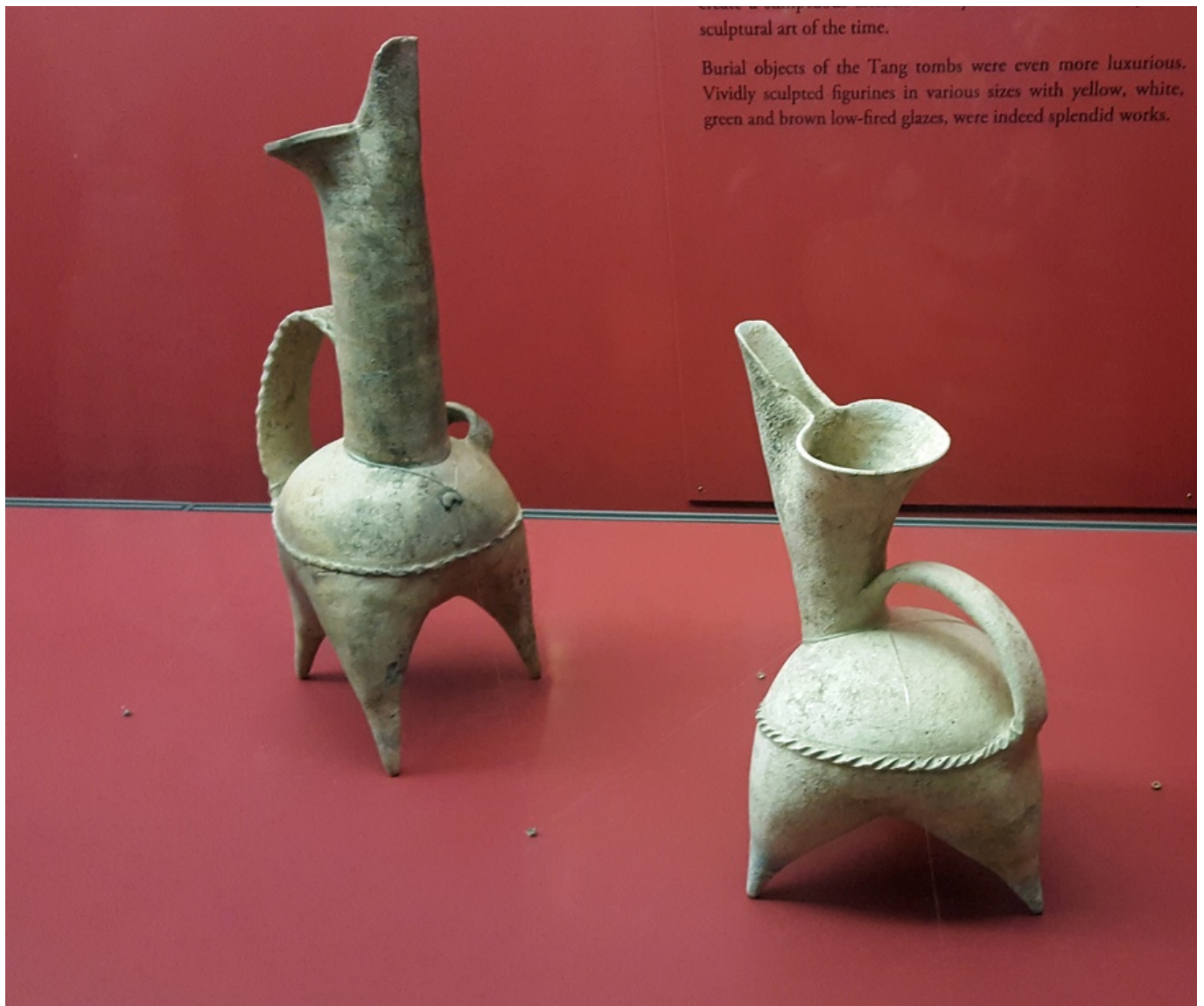
White Pottery guei-pitchers from the Neolithic Dawenko culture, 4300-2500 B.C.E. Because China has been making cool pottery for several thousand years.