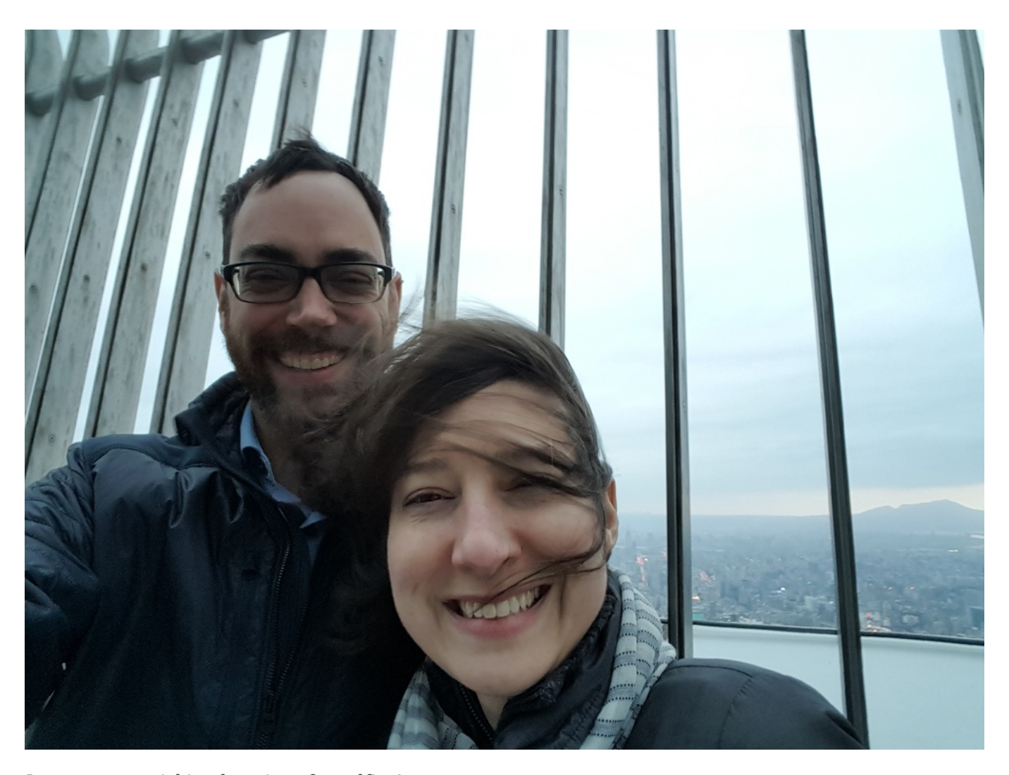
I am great at picking locations for selfies!