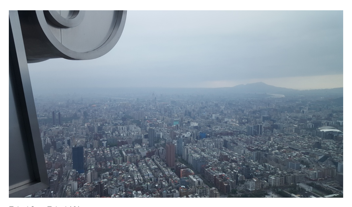
Taipei from Taipei 101

Taipei has about a third of the population of Taiwan contained within its metro area.