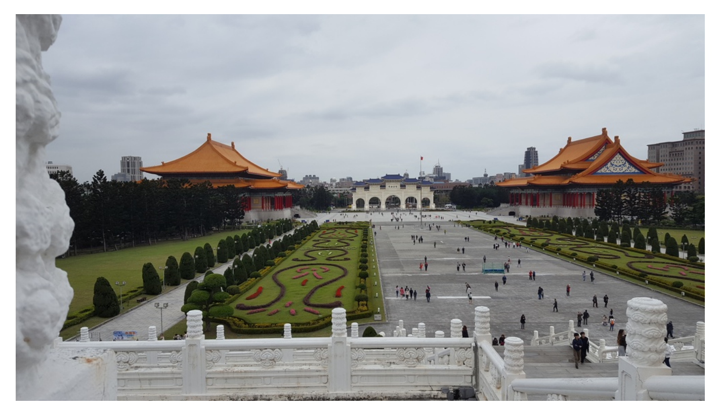
Looking out into the memorial plaza. Or maybe a memorial plaza.