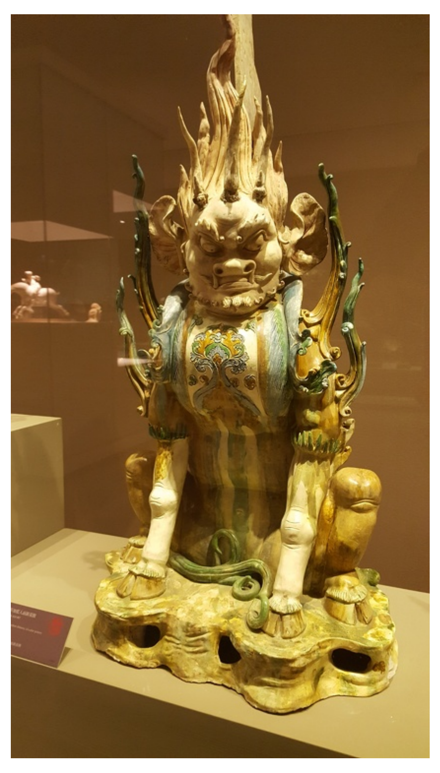
"Tomb-Guardian Chimera", A.D. 618-907, tri-color pottery from the Tang Dynasty.