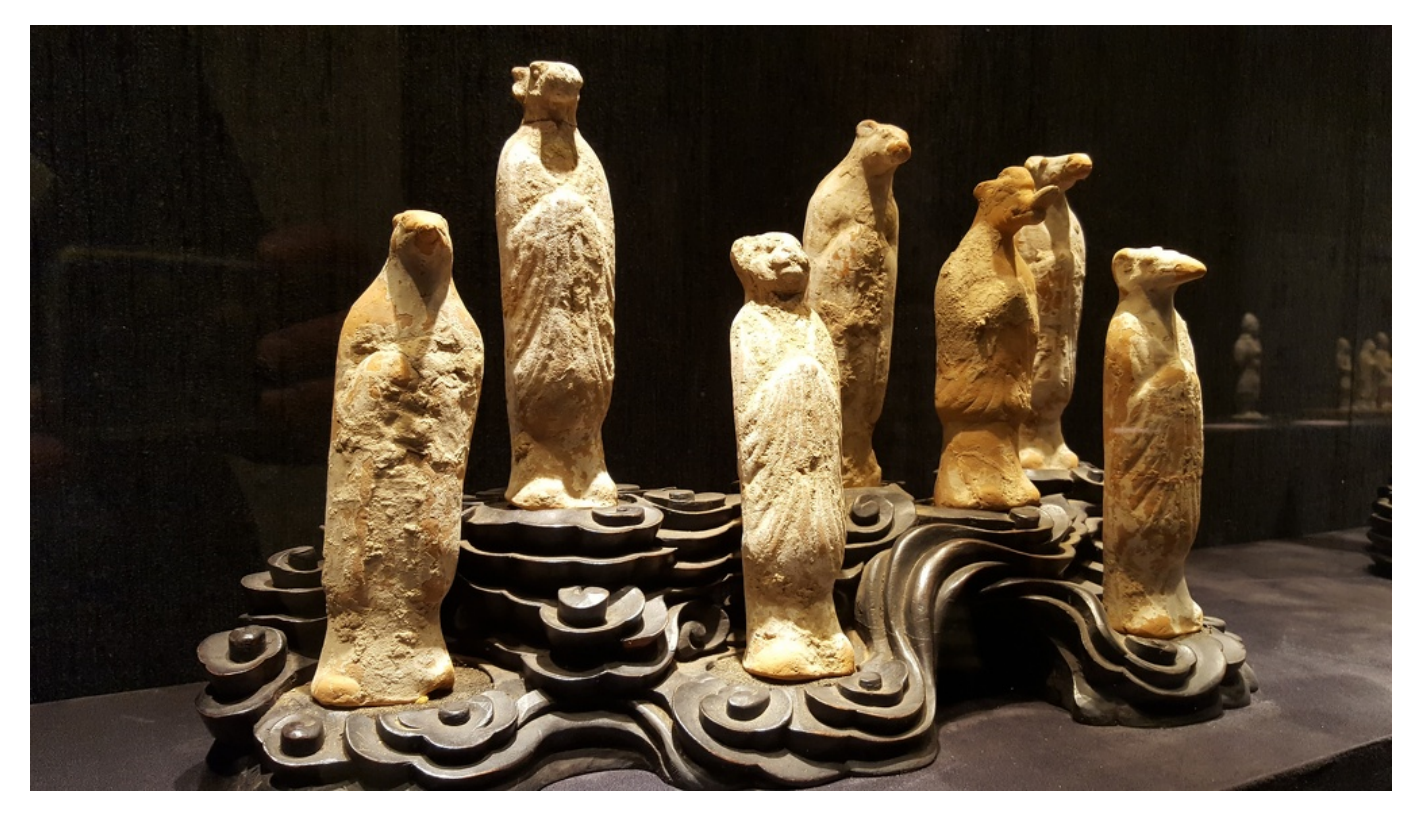
Fabulous ancient Chinese sculptures at the National Museum of History in Taipei.

We took the subway and then wandered through Taipei Botanical Garden, peaceful but a bit hollowed out by winter, and into the adjoining National Museum of History. Several exhibits were closed, but what remained contained some gems.