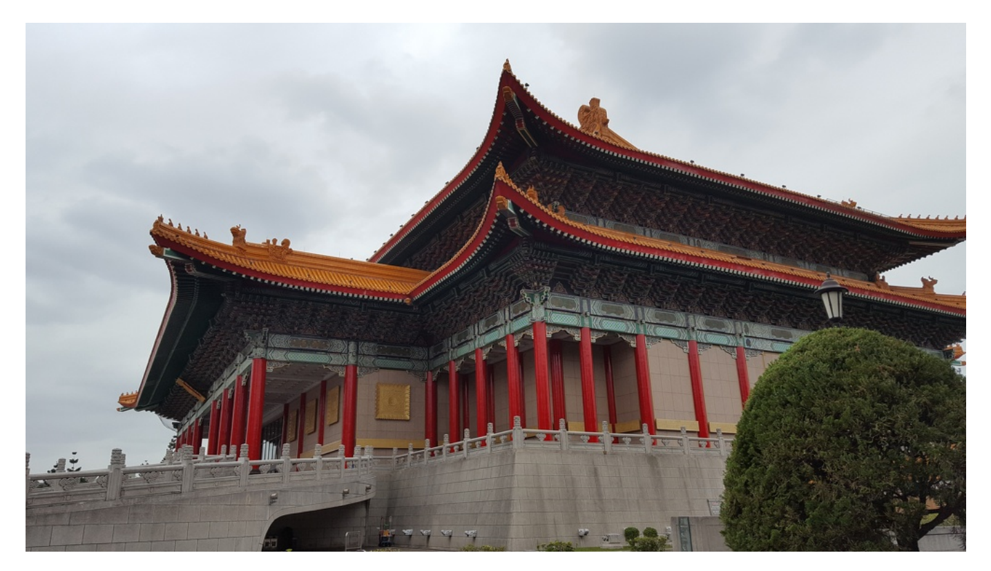
Admittedly, it's an impressive memorial.