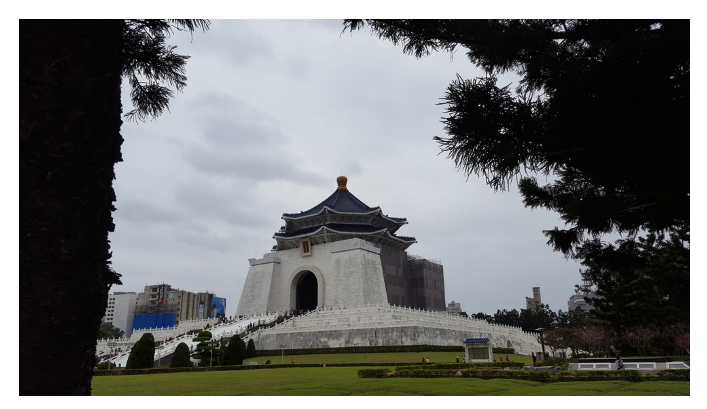
Chiang Kai-Shek Memorial

Historical artifacts taken from mainland China! Giant memorials to people who took historical artifacts from mainland China! Politics in Taiwan is hard to escape. Even if they let you use the Escape Sling. Which they did not.