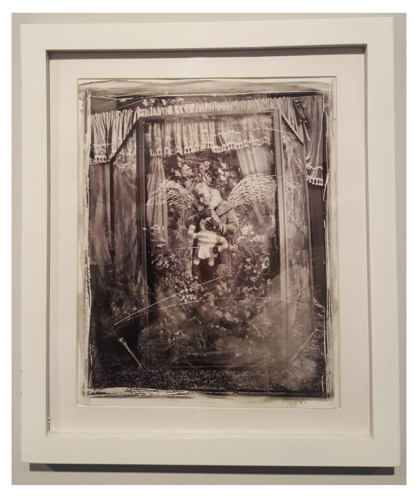
"Leaves and Grass" by Maleonn (2016) at the Shanghai Museum of Contemporary Art.