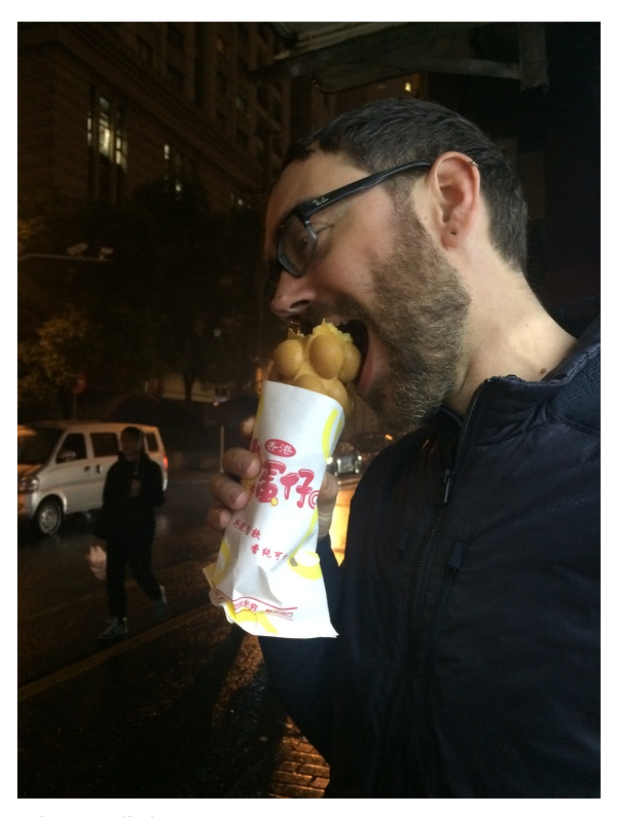
Redemptive waffle thingie!