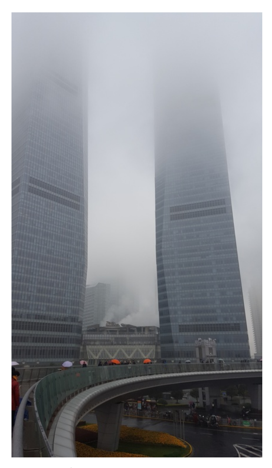
Foggy Financial District