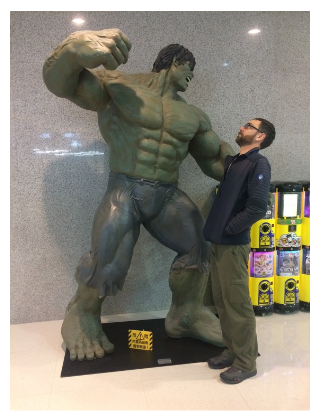
Sunday\ night's\ adventure's\ in\ the\ mall.