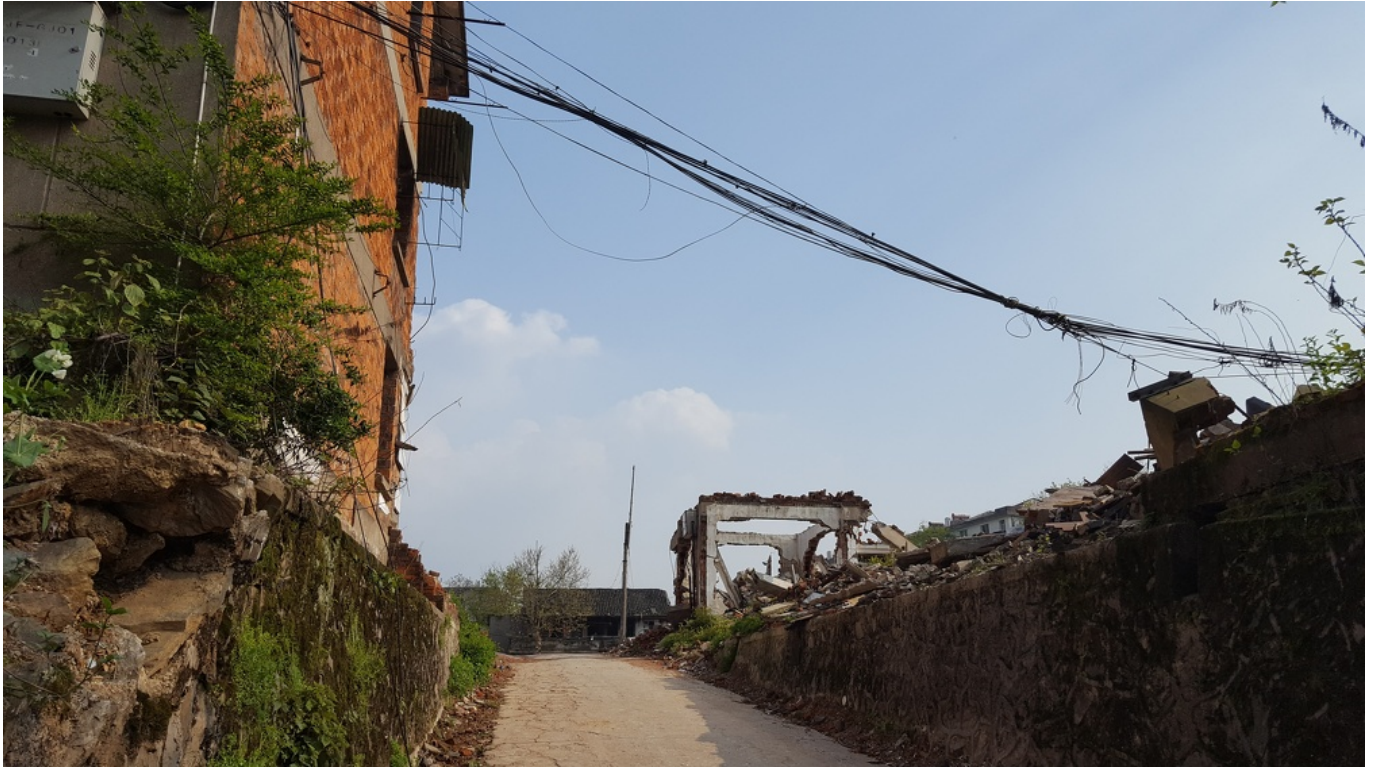
Deconstruction before new construction.

You know what we haven't mentioned yet this post? Scooters!