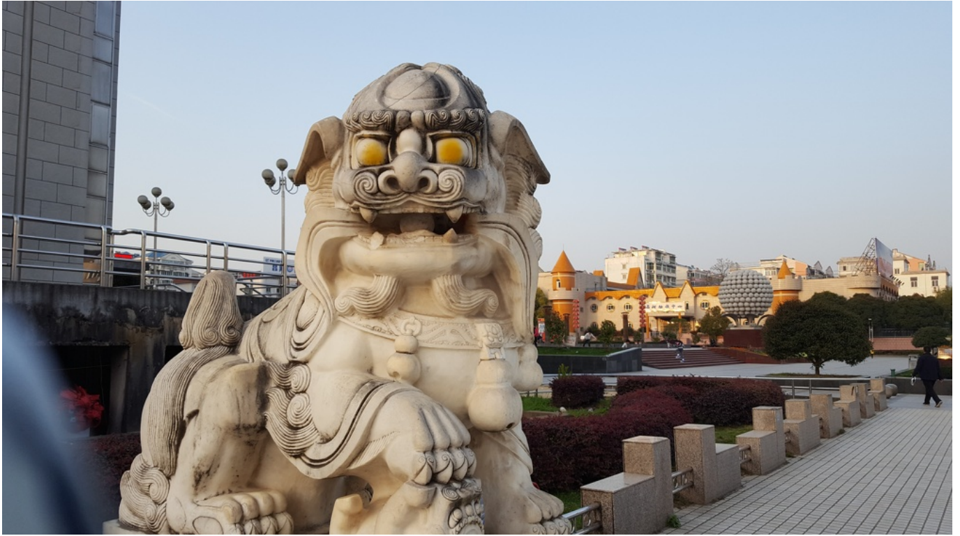
Just your usual collection of lion statue, giant disco ball and a western style castle building.