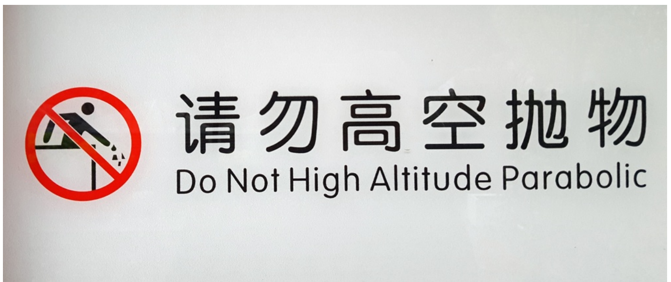
Do Not High Altitude Parabolic