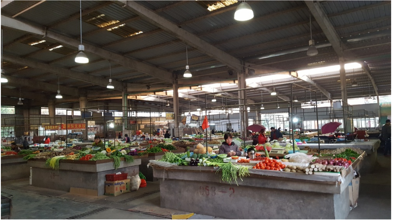
The Helicopter Factory

Christy's name for a big collection of food vendors in an old helicopter factory. This was right next to the delightful Snack Street.