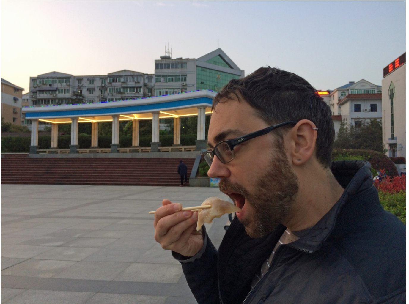
Eating dumplings from Snack Street in a nearby plaza.

So many tasty options, even a few without meat!