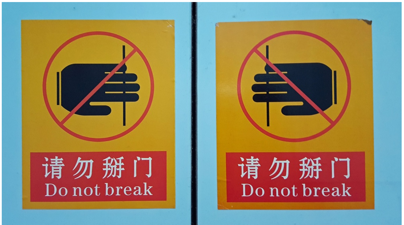
Do not break (on elevator door).