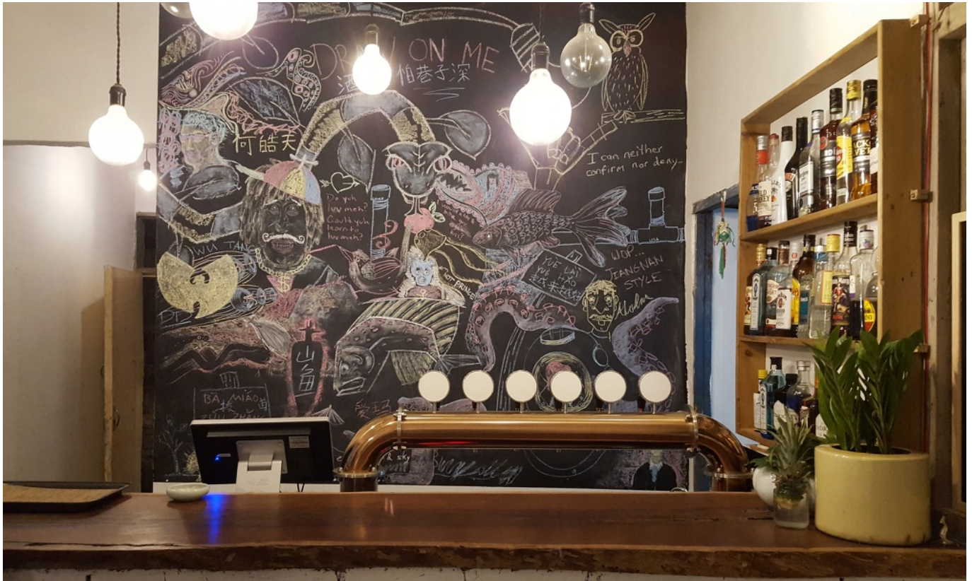
At the Southern Sloth

Ok, we've moved from signs to chalkboards, but The Southern Sloth is a restaurant near the sculpture factory that serves some craft beer and western style food. Frequent hangout for expats in the area.