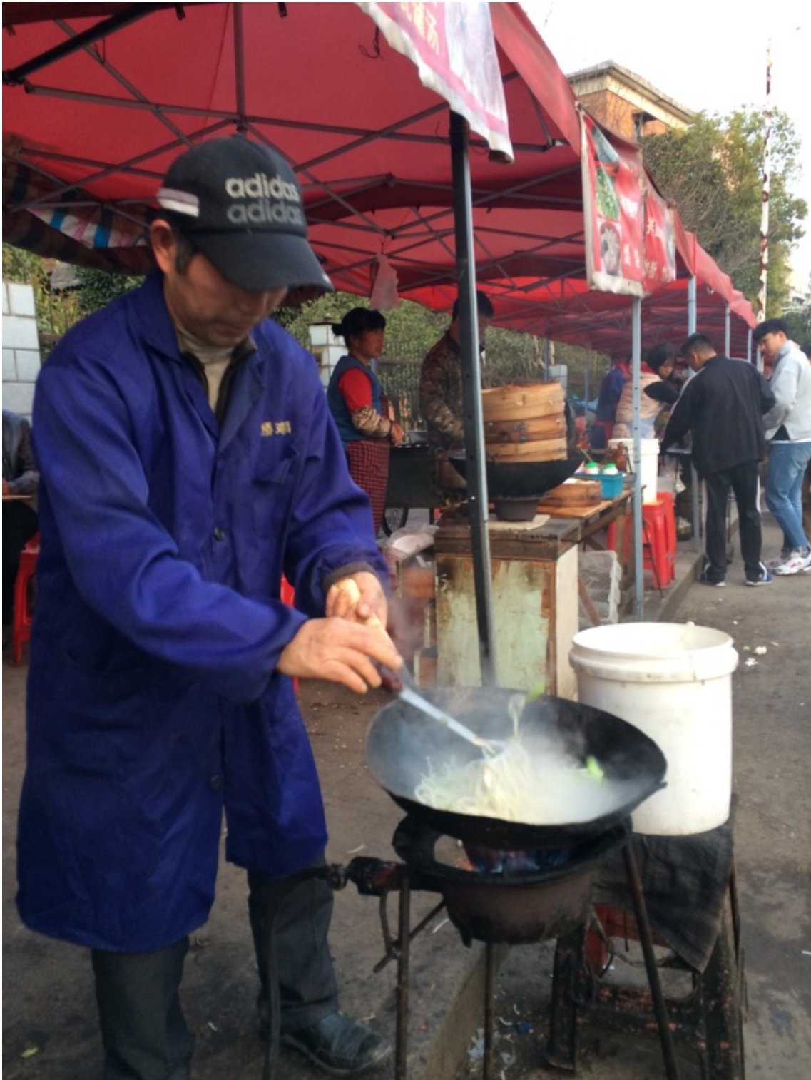
Our dinner being prepared on Snack Street.