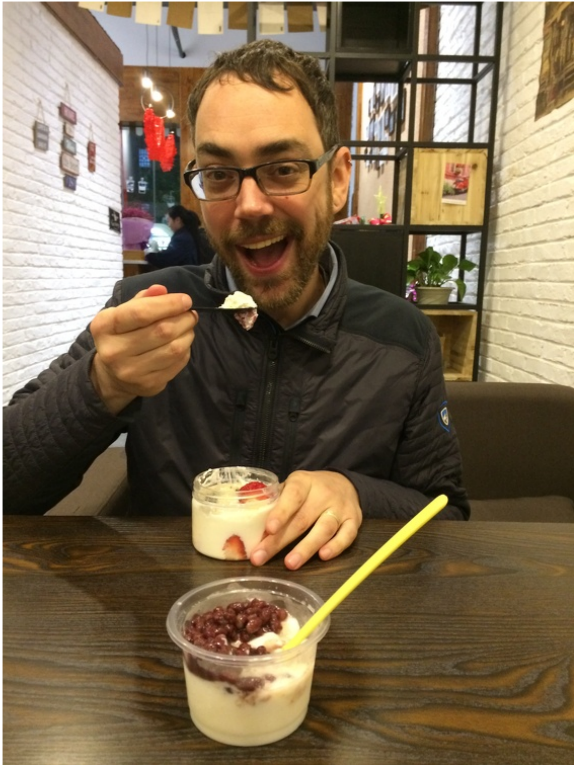
Always end with desert! Bean and strawberry options.