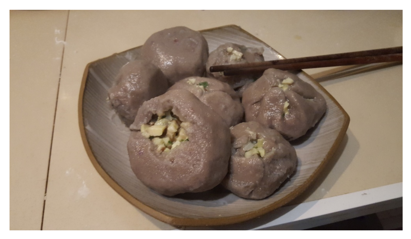
We had trouble locating some key ingredients in the gluten free ones which resulted in some lesseffective substitution. They still came out a fun color!

It was super nice of Aimee to teach us how to make these and even come up with a GF recipe and deal with our inability to find the right ingredients. Fun was had, tasty dumplings were eaten!